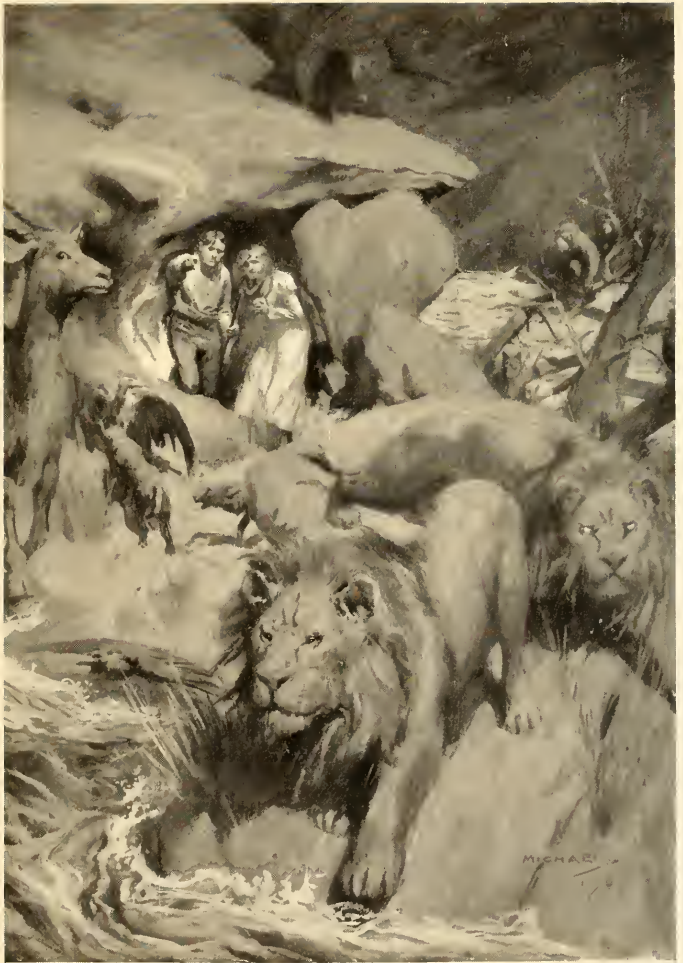
"The two of them . . . crept to the mouth of the cave" (see page 27).